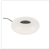
TL12409-BK/OP Black/Opal Glass